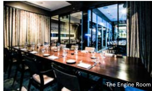
The Engine Room

Overlooking the Yarra River and directly situated alongside the Crown Riverwalk, the Terrace offers unobstructed views of the city skyline. Exclusively available for up to 30 guests meticulously set along on a long dining table. Partially covered and fully enclosed this dining space offers heating for cooler months of the year, or partial open windows and ceilings to take advantage of those warmer Melbourne days.